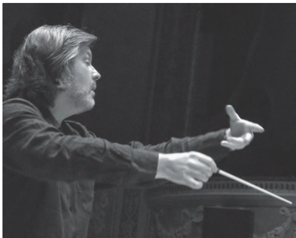
James MacMillan's engagements as a conductor are managed by Intermusica. Please visit www.intermusica.co.uk/macmillan

*Liturgical works for future publication