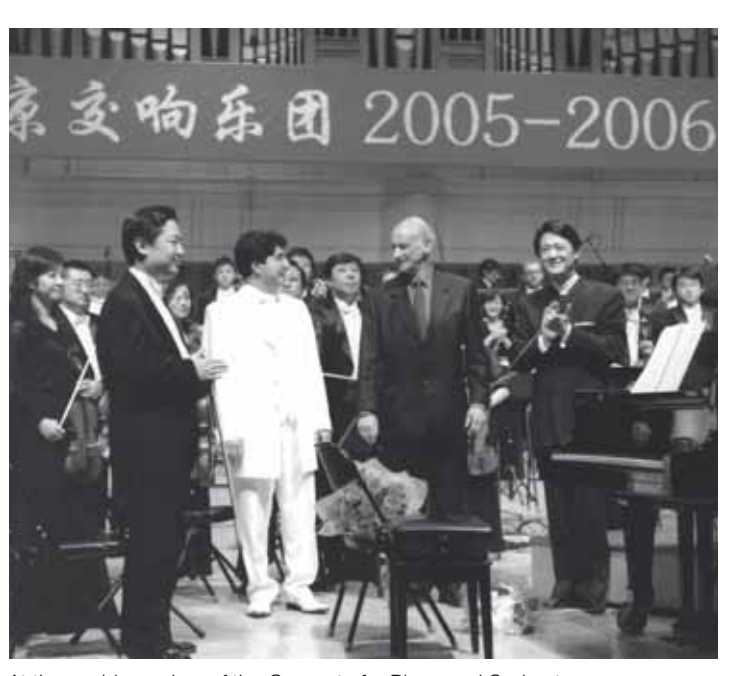
At the world premiere of the Concerto for Piano and Orchestra.