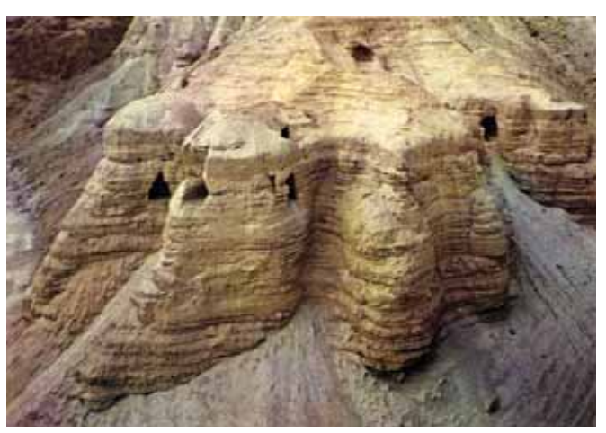
The Qumran caves near the Dead Sea – the Scrolls found here are the text source for Ami Maayani's opera-oratorio The War of the Sons of Light Against the Sons of Darkness .