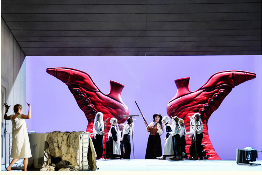
The premiere staging of Pierangelo Valtinoni's The Wizard of Oz at Zürich Opera

Following on from the international success of his operas Pinocchio and The Snow Queen. Pierangelo Valtinoni's The Wizard of Oz was unveiled by Zürich Opera in November with a 15 performance run. The 100-minute children's opera, combining adult vocalists, children's chorus and chamber orchestra, was praised by mixedage audiences and press alike: